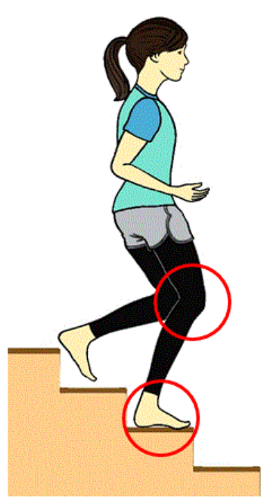
Figure 2: The image of step down the corridor with flat grounding and bending knee.

In this way, it is important to move the center of gravity forward and downward, and to place one foot on the lower step moving the weight. This is exactly the same as two-axis operation that moves the center of gravity to right and left in each step by flat grounding [9]. The grounded leg receives the center of gravity of the body. The knee is bent in response to the impact, with further lowering the center of gravity ( Figure 2 ).