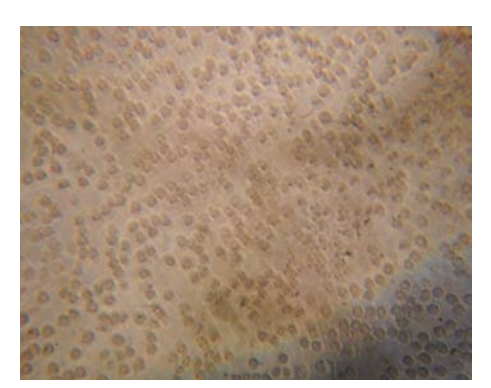
Fig. 3: RBC in Hypertonic solution with Plant extract (6mg/ml) (Protection of Hypertonic induced HRBC membrane lysis)

Some of the NSAIDs are known to posses membrane stabilization properties which may contribute to the potency of their anti-inflammatory effect. Though the exact mechanism of the membrane stabilization by the extract is not known yet, hypotonicity-induced hemolysis may arise from shrinkage of the cells due to osmotic loss of intracellular electrolyte and fluid components. The extract may inhibit the processes, which may stimulate or enhance the efflux of these intracellular components (lwueke,2006).