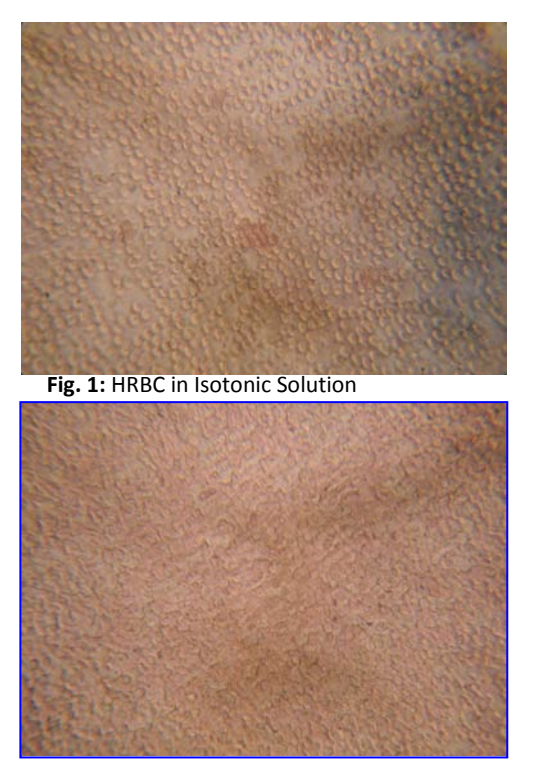
Fig. 2: HRBC in Hypertonic Solution -Control (Lysis of Hypertonic induced HRBC membrane)

Values are expressed as X (Mean) \pm SEM, n=3. (One way ANOVA followed by Student t-test). Statistically significance of <sup>a</sup>P < 0.05, <sup>b</sup>P<0.01, <sup>c</sup>P<0.001 and <sup>d</sup>NS in comparison to respective control.