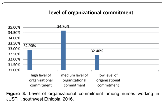
Figure 3: Level of organizational commitment among nurses working in JUSTH, southwest Ethiopia, 2016.

Proportional allocation of nurses who were working in Jimma University Specialized Hospital in each wards indicated as follows in the following chart in order to gate the final sample size