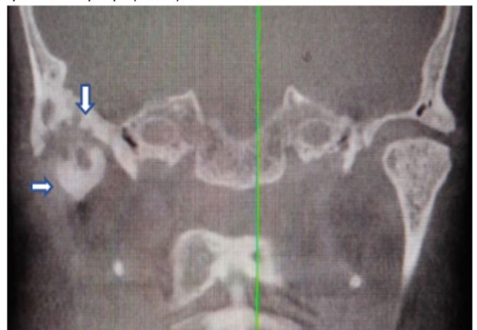
Figure 2. Coronal CT: Severe bone resorption of the articular fossa and condylar head (arrows).