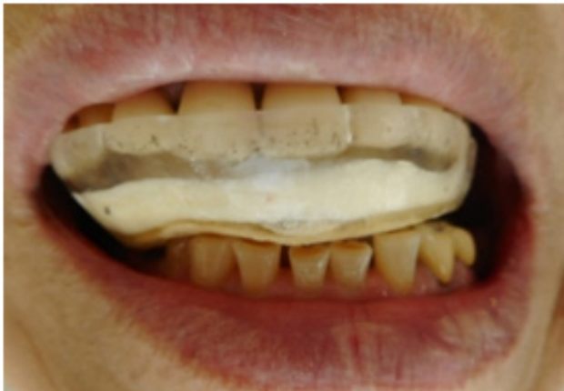
Figure 4. Inclined plane leads the mandible to the left (arrow).