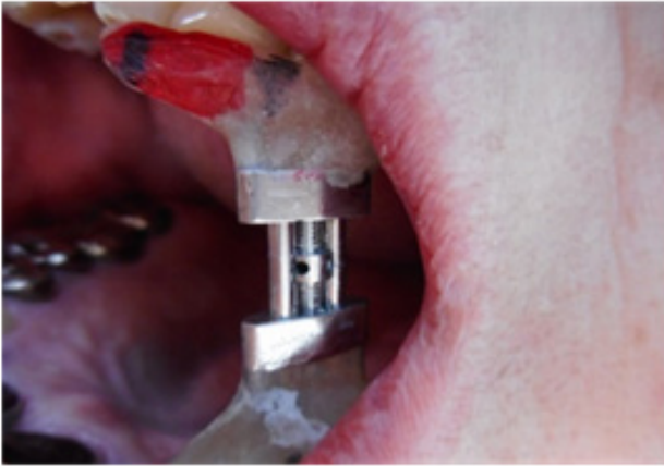
Figure 3. Mouth gag using expansion screw.