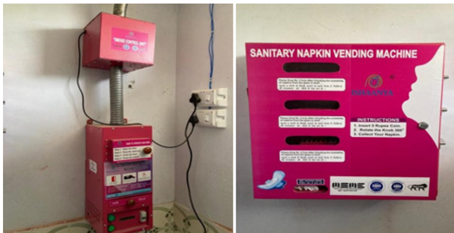
Figure 1. Facilities for mensuration.

Key findings protected that there has been inadequate get right of entry to secure and personal centres for MHHM coupled with displacement precipitated shifts in menstrual practices with the aid of using girls. There become a slender interpretation of what an MHHM reaction includes, with a focal point on supplies; substantial hobby in information what a progressed MHHM reaction could consist of and acknowledgement of constrained current MHHM steerage throughout diverse sectors; and inadequate session with beneficiaries, associated with pain asking approximately menstruation, and constrained coordination among sectors.