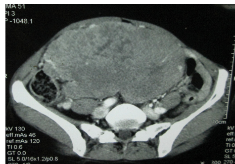
Figure 1: Axial section of the abdominal mass.

Secondary tumors of the omentum are common in peritoneal carcinomas; they usually are of digestive or gynecological origin [4].